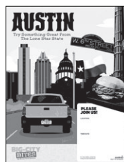
TIME DATE POSTER