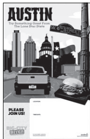
TIME DATE POSTER

All of the individual city destinations featured in our Big-City Bites portfolio are supported with a variety of print and customizable electronic tools that you can use to create awareness and drive participation in your promotion. To access these tools, please visit the Resident Dining Promotions Link , accessible from the Universities Marketing Page on Sodexo Net . Following are some of the specific support materials available for your celebration of AUSTIN .