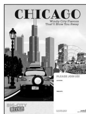
TIME DATE POSTER