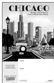
TIME DATE POSTER

All of the individual city destinations featured in our Big-City Bites portfolio are supported with a variety of print and customizable electronic tools that you can use to create awareness and drive participation in your promotion. To access these tools, please visit the Resident Dining Promotions Link , accessible from the Universities Marketing Page on Sodexo Net . Following are some of the specific support materials available for your celebration of CHICAGO .