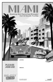
TIME DATE POSTER