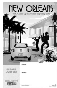
TIME DATE POSTER