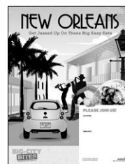
TIME DATE POSTER