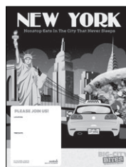
TIME DATE POSTER