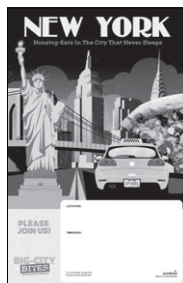
TIME DATE POSTER

All of the individual city destinations featured in our Big-City Bites portfolio are supported with a variety of print and customizable electronic tools that you can use to create awareness and drive participation in your promotion. To access these tools, please visit the Resident Dining Promotions Link , accessible from the Universities Marketing Page on Sodexo Net . Following are some of the specific support materials available for your celebration of NEW YORK .