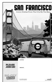
TIME DATE POSTER

All of the individual city destinations featured in our Big-City Bites portfolio are supported with a variety of print and customizable electronic tools that you can use to create awareness and drive participation in your promotion. To access these tools, please visit the Resident Dining Promotions Link , accessible from the Universities Marketing Page on Sodexo Net . Following are some of the specific support materials available for your celebration of SAN FRANCISCO .