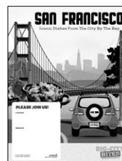
TIME DATE POSTER