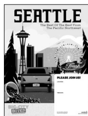
TIME DATE POSTER