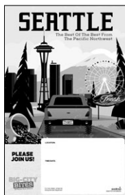
TIME DATE POSTER

All of the individual city destinations featured in our Big-City Bites portfolio are supported with a variety of print and customizable electronic tools that you can use to create awareness and drive participation in your promotion. To access these tools, please visit the Resident Dining Promotions Link , accessible from the Universities Marketing Page on Sodexo Net . Following are some of the specific support materials available for your celebration of SEATTLE .