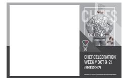
Tear Off Sheet

Tear off some of the 4" x 6" papers from the paper pad in your kit and place them on every table and ask students to write praises for your chefs and culinary team for a great job meeting everyone's needs. Place a large, decorated container at the entrance/exit to the dining area to collect the completed papers. Each evening, post the comments on a large bulletin board for everyone to read and enjoy the next day – especially your chefs and culinary professionals.