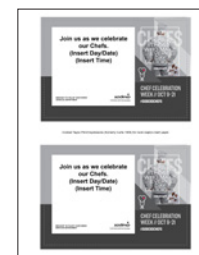
Small Napkin Insert