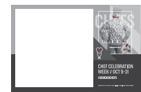
Tear Off Sheet