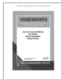
Large Napkin Insert