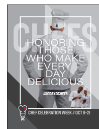
Event Mini Poster

Please visit the Campus Marketing page on Sodexo Net to access the Resident Dining Promotions Link and find Additional Promotions Marketing Templates to promote Chef Celebration Week - Honoring Those Who Make Every Day Delicious .