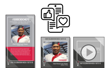
Social Media Files with Animated Post and Templates for Customization

*Publisher templates included for customization